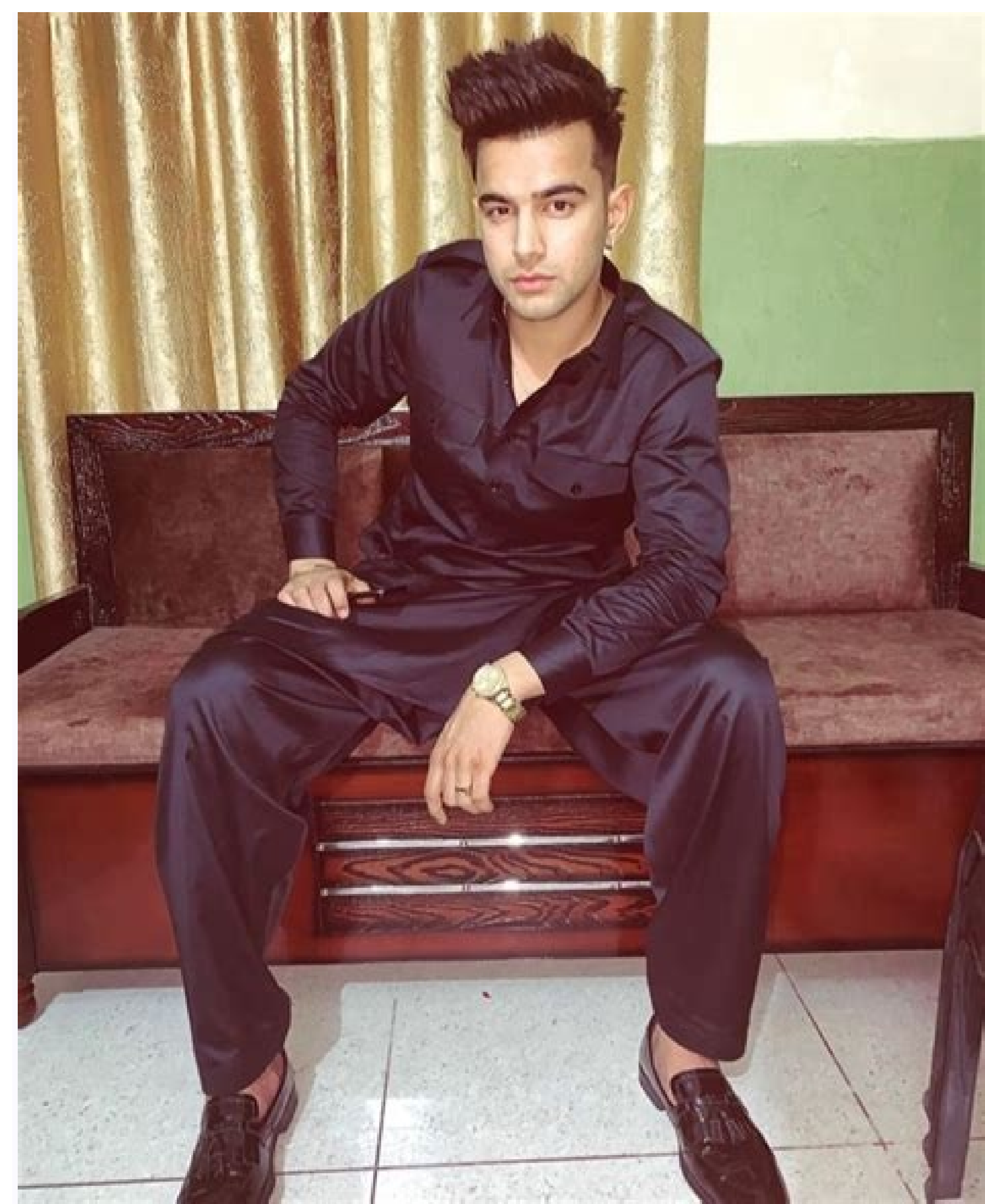
Kuldeep manak chadar song lyrics. Chadar remix song kuldeep manak. Chadar song kuldeep manak djohal. Kuldeep manak chadar song download mr jatt. Kuldeep manak chadar song download.