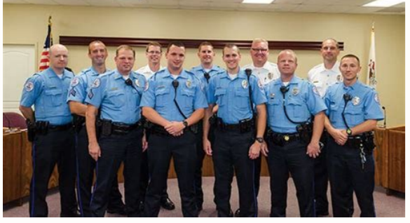
Collingswood nj police department. Collingswood nj police.