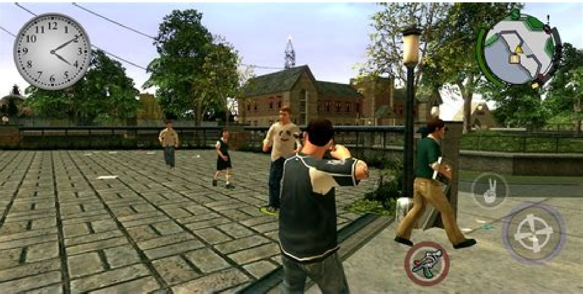
Download game bully apk+data android highly compressed. Bully apk data highly compressed. Bully apk data highly compressed download. Download bully anniversary edition apk data highly compressed. Download game bully apk data highly compressed.