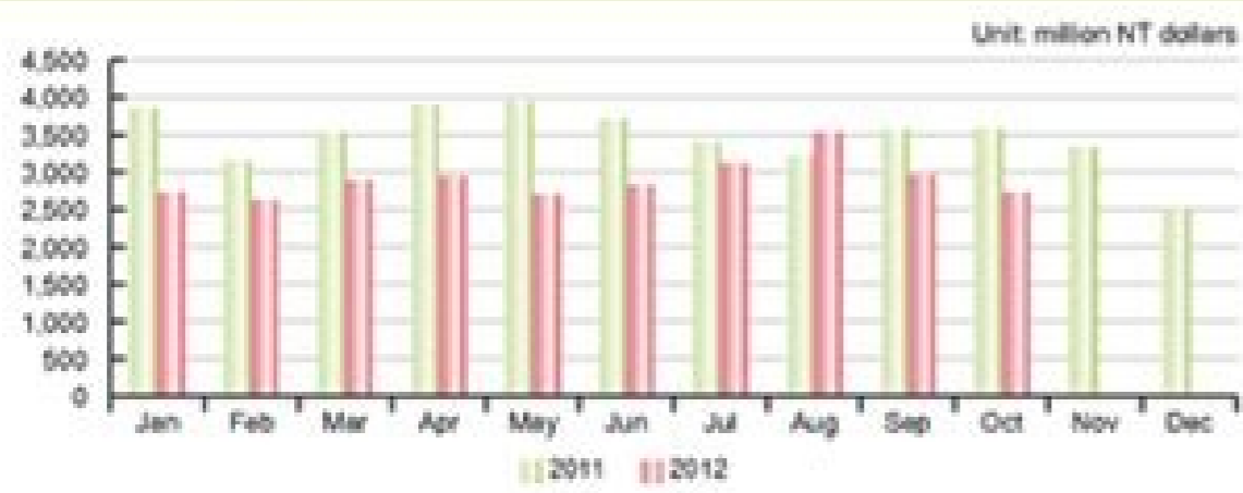
Fig. 9 Revenue Trend of Hannstar