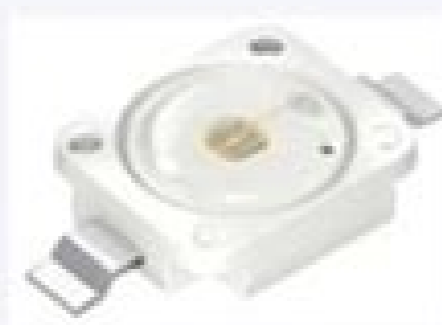
Fig. Golden Dragon SFH 4232A