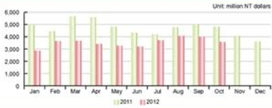
Fig. 8 Revenue Trend of CPT

and also their yields to compete with Japan and Korean manufacturers. Besides, as more Taiwan workers are lured with high salaries and great benefits by China companies, Taiwan manufacturers must find out a way to keep their talented people and to seek advancing their professional skills in order to write another success story. ☺