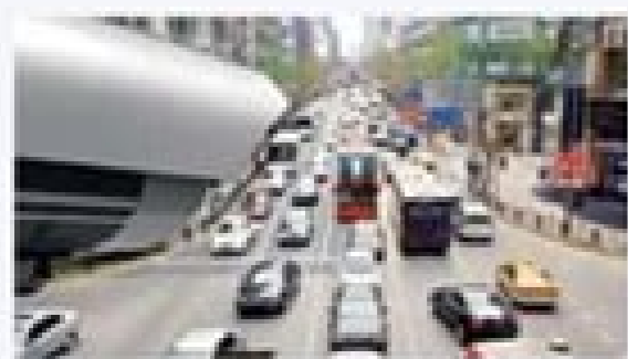
Fig. Golden Dragon SFH 4232A is suitable for general safety applications, such as for traffic monitoring.

http://www.osram-os.com/pr-IR-Golden-Dragon