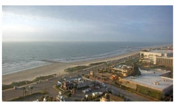
Galveston weather. Galveston tomorrow. Tomorrow galveston weather. Gio texas. Galveston forecast tomorrow.