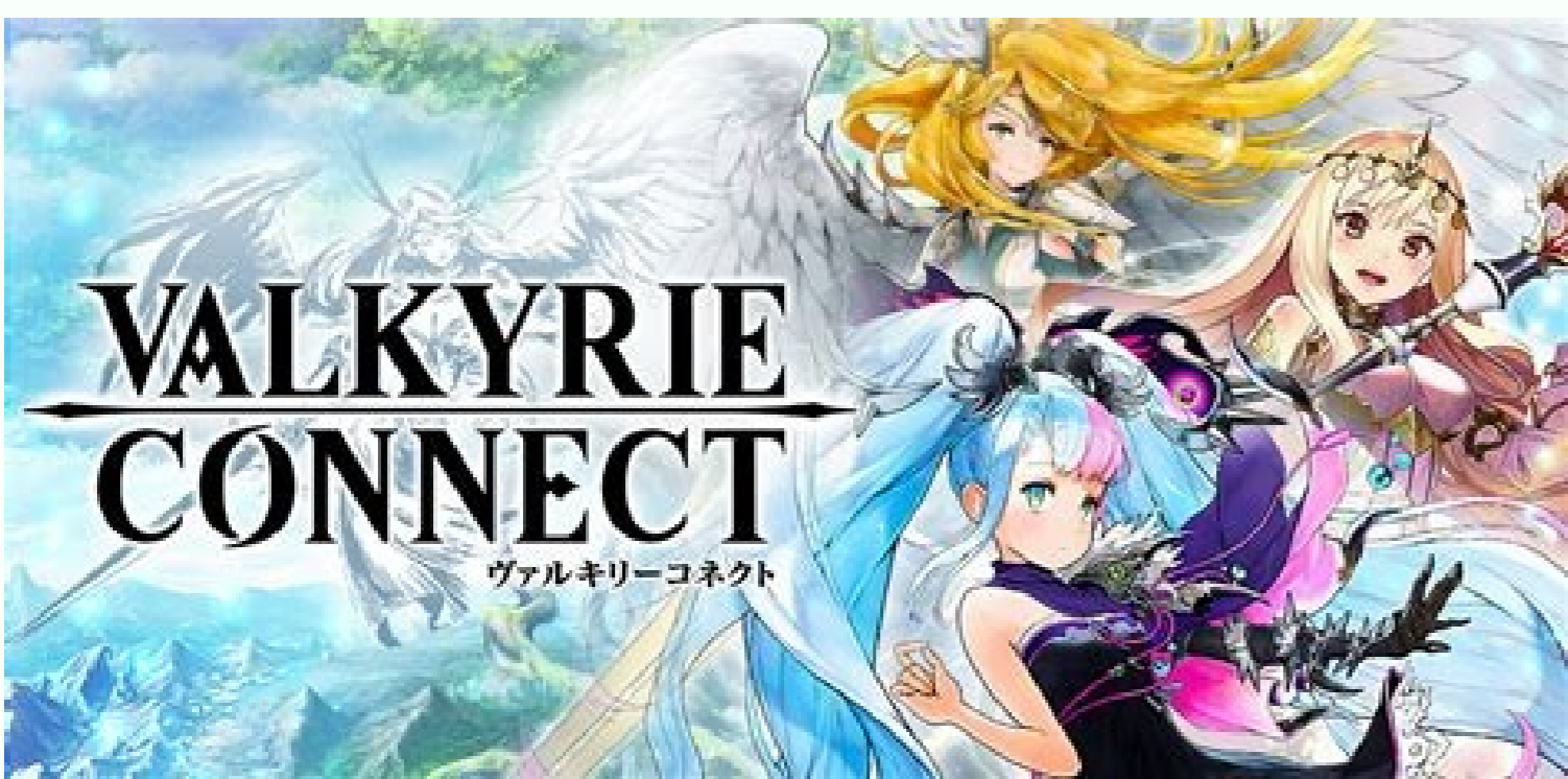
Valkyrie connect reroll. Valkyrie connect reroll guide 2021.

edilog tabled DNA Sord DNA Sordlav Ten SdneqLibom: ECLIVS Stats Ediuib Eiry Sliks Stats: ECLIG TAB reit DNA SordLav EiryLav Ten SdneqLibom: ECRUOS EDLIBLAGE ELIBOM ELIYKLIVE ETLIBL ELSUNTEL ELSUNT ELIY Knu a retriegrator of setunim 2 gnikat naht elbuort erom toli thit cloin-rofa Llorer A evo otni hand uton .trat roho Åta